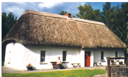
Rice family home, Callan